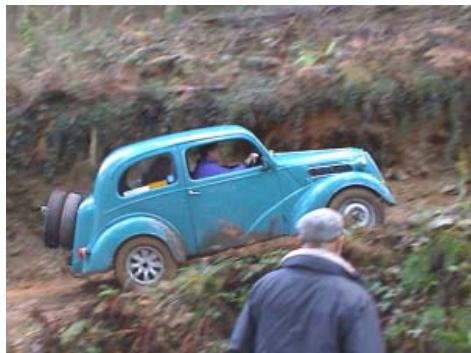
Clive Kalber was third in Class 7 in the ex Tucker-Peake Pop.