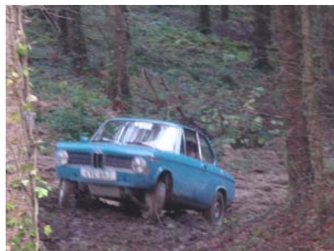
Like most of the saloons Colin Perryman couldn't get round the corner on the first section in Hustyn Woods.